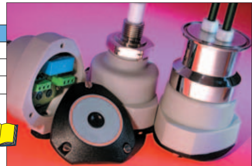
LVCN4000 Series, shown smaller than actual size.