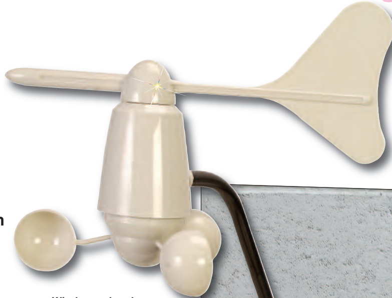
Wind speed and direction sensors shown smaller than actual size.

The unit includes a radio controlled clock with different alarms and snooze functions with displays of date and day of the week (6 languages). LCD shows time of rising and setting of sun and moon with indication of moon phase. Wind chill factor and dew point with programmable alarms for temperature and storm conditions. Data logging software and cable are included.