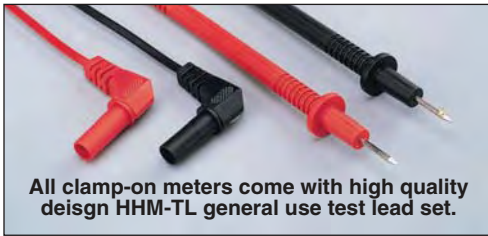
All clamp-on meters come with high quality design HHM-TL general use test lead set.